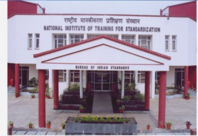
BIS: Institute of Training

The quality ecosystem in India comprises of a sizable body of knowledge in the form of standards, multiple conformity assessment programmes, and national