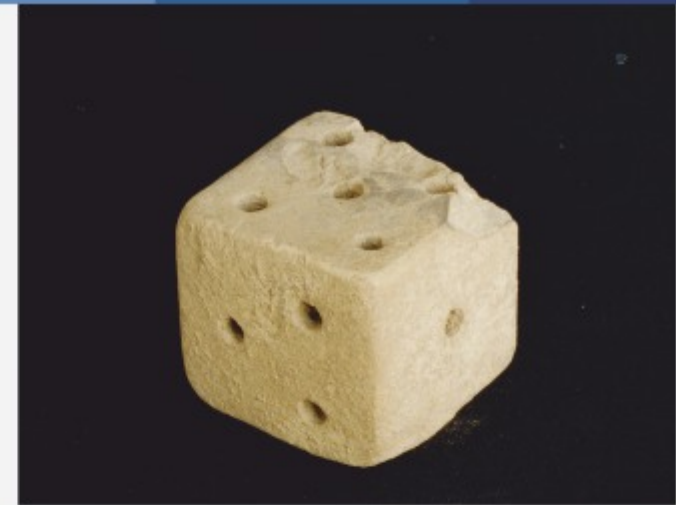
Dholavira Dice.

Policy guidelines based on good regulatory practices and regulatory impact assessment need to be established for the development, implementation, review, and revision of Technical Regulations.