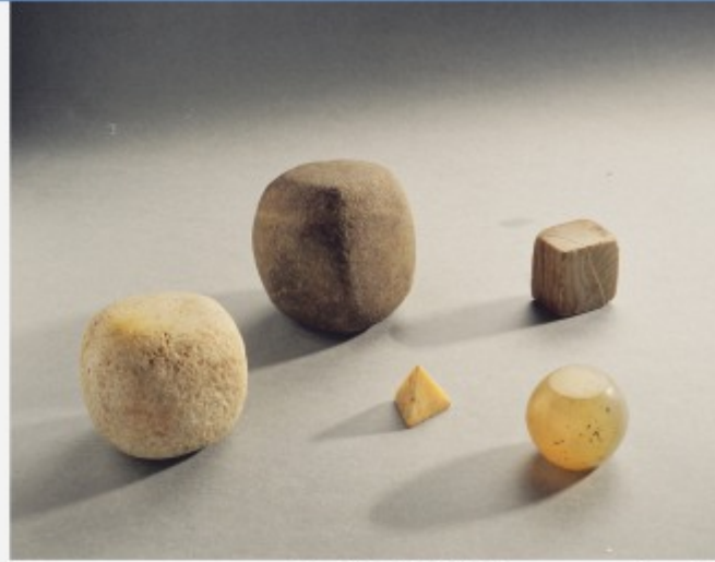
Dholavira Weights.

Presently, there are limited means for post-market testing of the actual level of conformance of the products placed in the market, especially those that are under self-declaration of conformity. As more and more products are expected to be brought under technical regulations, there is a need to establish a national market surveillance programme that would monitor conformity of products placed in the market, whether certified or regulated under self-declaration of conformity. The results of such