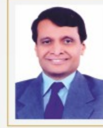
सुरेश प्रभु SURESH PRABHU